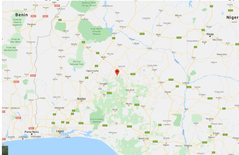
Figure 1. Location of proposed site in Osun State, Nigeria.

Oluwasun et al. compare the effectiveness of biogas production from pig dung and photovoltaics in Nigeria. (Oluwaseun, A. T.; Mgbachi, C. A.; Okelola, M. O.; Ajenikoko, G. A. A Comparative Analysis of Renewable Energy Using Biogas and Solar Photovoltaic Systems: A Case Study of Ajaba, In Osun State Control Theory and Informatics 7, 7-13 (2018).) They use MatLab ® to estimate the energy production from these two alternative energy sources.